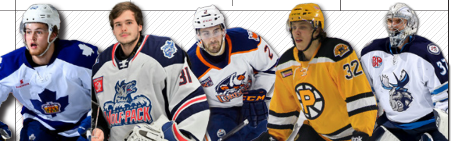
L. TO R.: AHL GRADUATES WILLIAM NYLANDER, IGOR SHESTERKIN, EVAN BOUCHARD, DAVID PASTRNAK, CONNOR HELLEBUYCK

From those roots, the American Hockey League has grown into a 32-team, coast-to-coast league that provides fans with exciting, high-level professional hockey while preparing thousands of players, coaches, officials, executives, trainers, broadcasters and more for careers in the NHL.