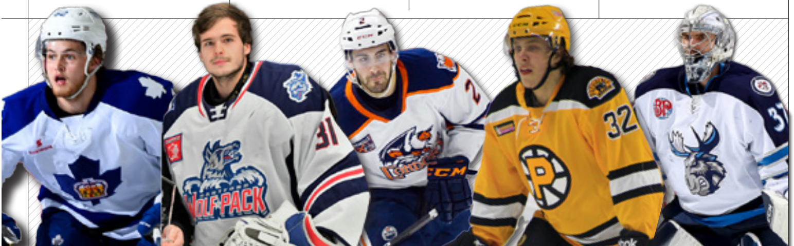
L. TO R.: AHL GRADUATES WILLIAM NYLANDER, IGOR SHESTERKIN, EVAN BOUCHARD, DAVID PASTRNAK, CONNOR HELLEBUYCK

From those roots, the American Hockey League has grown into a 32-team, coast-to-coast league that provides fans with exciting, high-level professional hockey while preparing thousands of players, coaches, officials, executives, trainers, broadcasters and more for careers in the NHL.